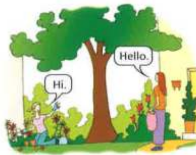
Mary sees her new neighbor.