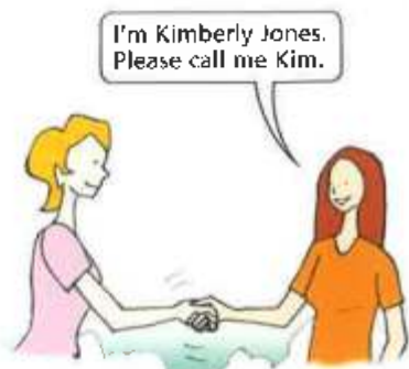
...and shake hands.