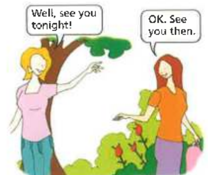
They say good-bye.