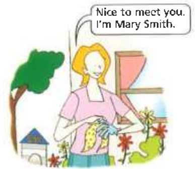
They walk toward each other....