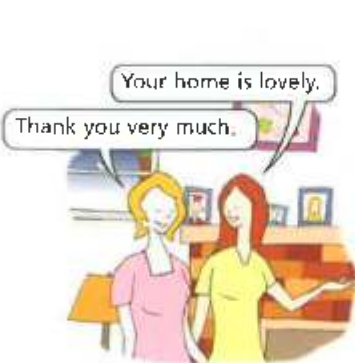
Kim looks around the house.