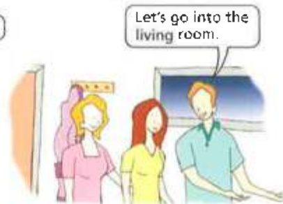
They go into another room.