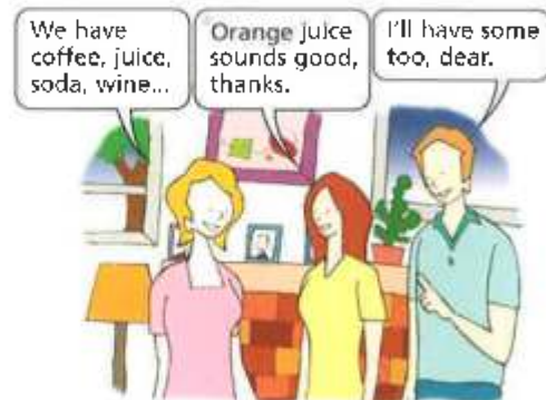
...and tells her the choices.